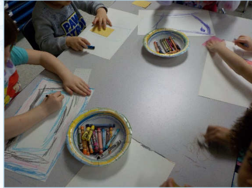
Preschool students illustrate pictures of their bedroom to go along with the book.